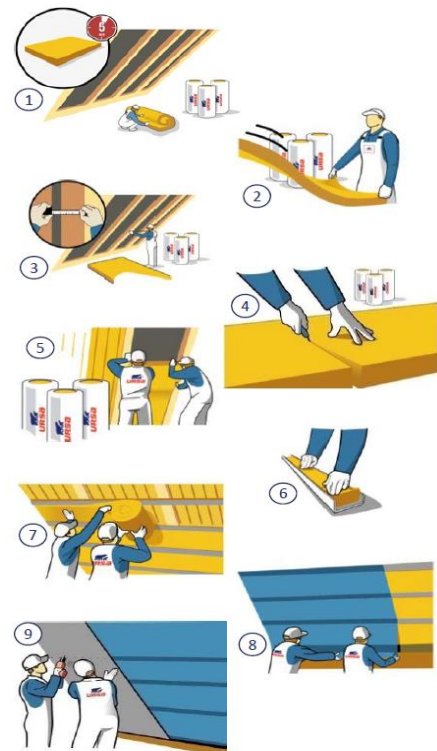
Figure 1. Application scheme for URSA GLASSWOOL